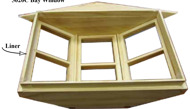
5020C Bay Window

Assemble the Interior 5020C Window Frames and glue them around or centered over the Windows after interior finishing is done.