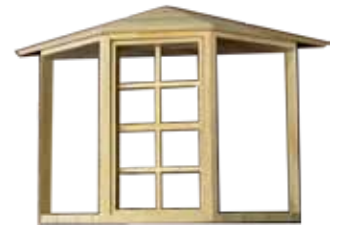
5008 partially disassembled

Interior trim goes around the Liners after installation - if your wall is extra thick from wallpaper or other thickness-additions, you might add an extra piece of a thin trim along the inside of the interior frame... \frac{5}{64} Stripwood (see www.realgoodtoys.com ) is attractive there.