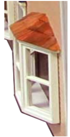
The 5020 Bay window does not include shingles

The 5020 Bay Window fits over a cutout 7\frac{3}{16} \times 5\frac{1}{4} See www.realgoodtoys.help then the “ Cut-Opening ” tab for slideshows of cutting holes for doors and windows.