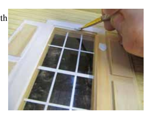
Paint the face and corner, but not the inside edges of the window frames