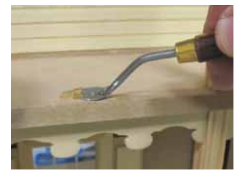
Clean up the glue residue