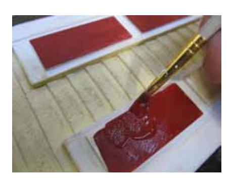
Make color transitions at outside corners

Sand all the surfaces and edges. Sand until the wood is showing and smooth. Sand each surface including every clapboard "board" with 320 grit sandpaper folded to keep it fresh.