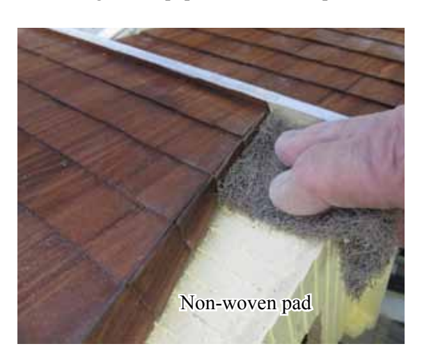
A "Non-Woven Abrasive Pad" (also called "Synthetic Steel Wool") is a fast start for sanding irregular shapes

Sand all the surfaces and edges. Sand until the wood is showing and smooth. Sand each surface including every clapboard "board" with 320 grit sandpaper folded to keep it fresh.