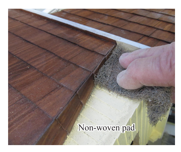
A "Non-Woven Abrasive Pad" (also called "Synthetic Steel Wool") is a fast start for sanding

Sand all the surfaces and edges. Sand until the wood is showing and smooth. Sand each surface including every clapboard "board" with 320 grit sandpaper folded to keep it fresh.