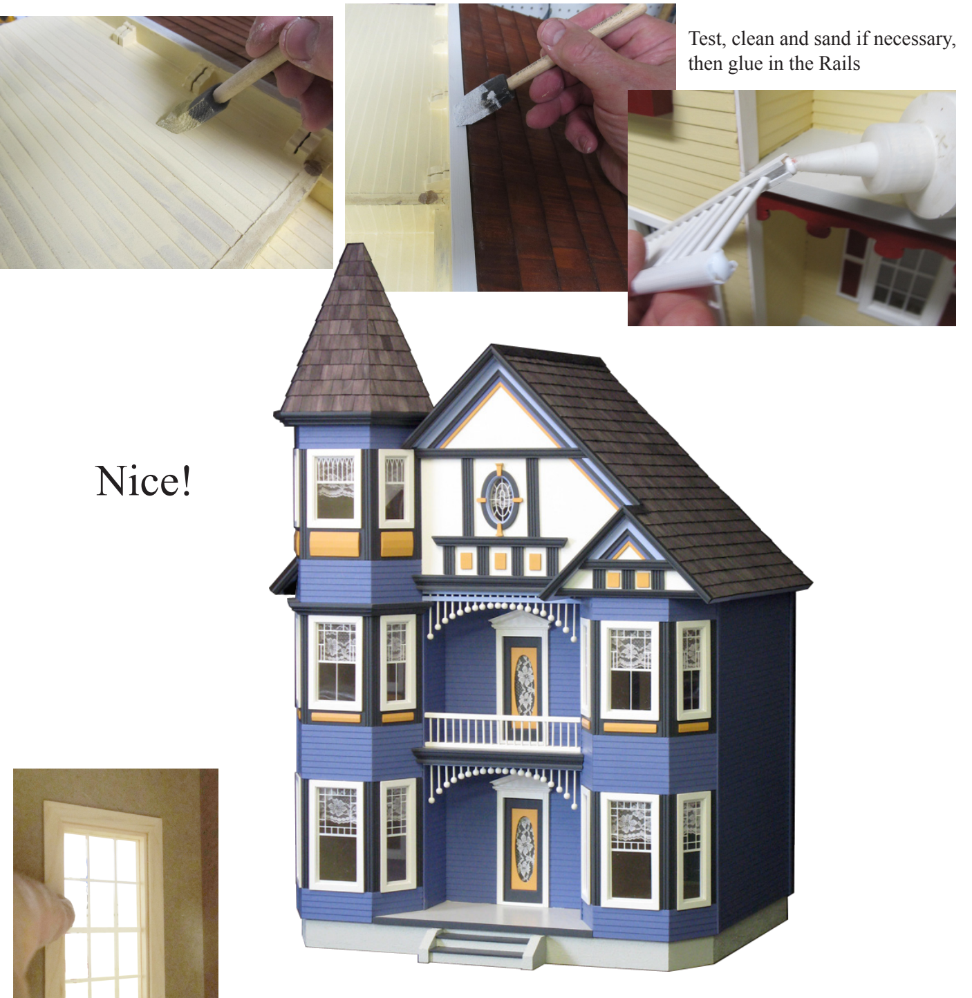
Interior Window Trim

Second-coat the painting. The second coat goes on thick and creamy with the amount of paint that won't leave drips or puddles. Keep transitions clean and straight.