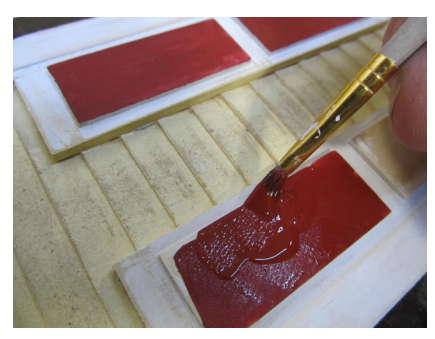
Make color transitions at outside corners

Sand all the surfaces and edges. Sand until the wood is showing and smooth. Sand each surface including every clapboard "board" with 320 grit sandpaper folded to keep it fresh.