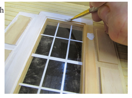
Paint the face and corner, but not the inside edges of the window frames