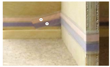
Flap and eyelets are on both sides of the Partition